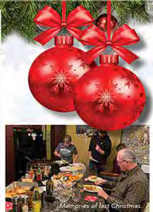
Memories of last Christmas.