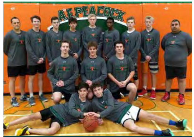
The Peacock Toilers senior boys basketball team.

Heritage Insurance is always happy to support many community organizations and the great work they do.