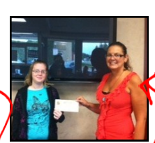
Marsha Welscher $50 Gift Card

306-693-7640 · 800-667-7640 · FAX 306-692-3661