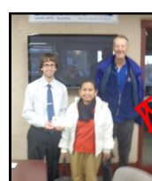
Garnet & FeBerg $50 Gift Card!