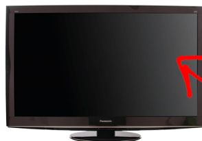
Jason Hall - Flat Screen TV!