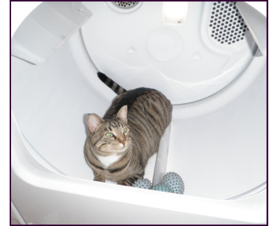
Taco, curiosity and the cat